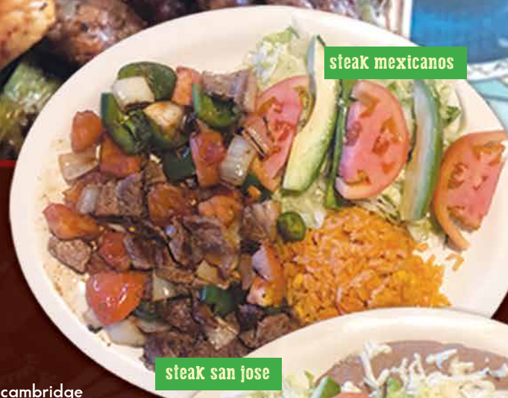
steak san jose