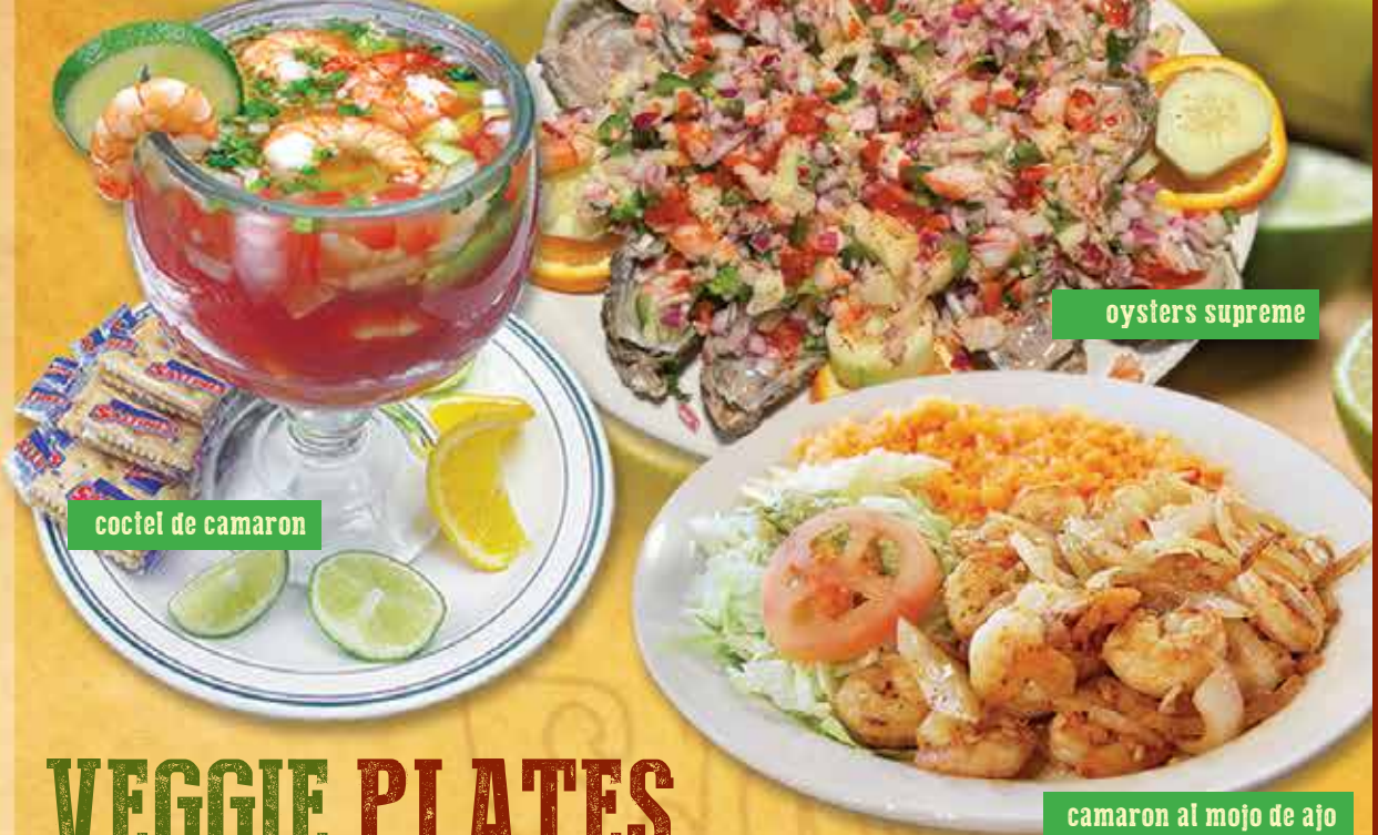
coctel de camaron

A bountiful plateful of grilled shrimp topped with cheese and served with rice - 17.99