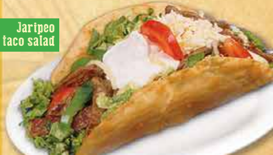
Jaripeo taco salad