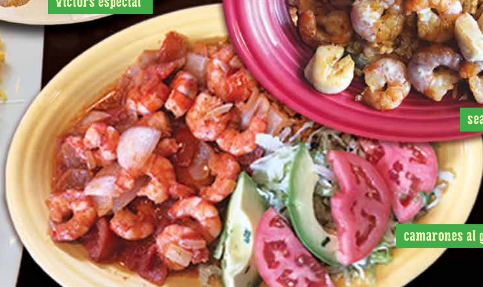
camarones al gusto